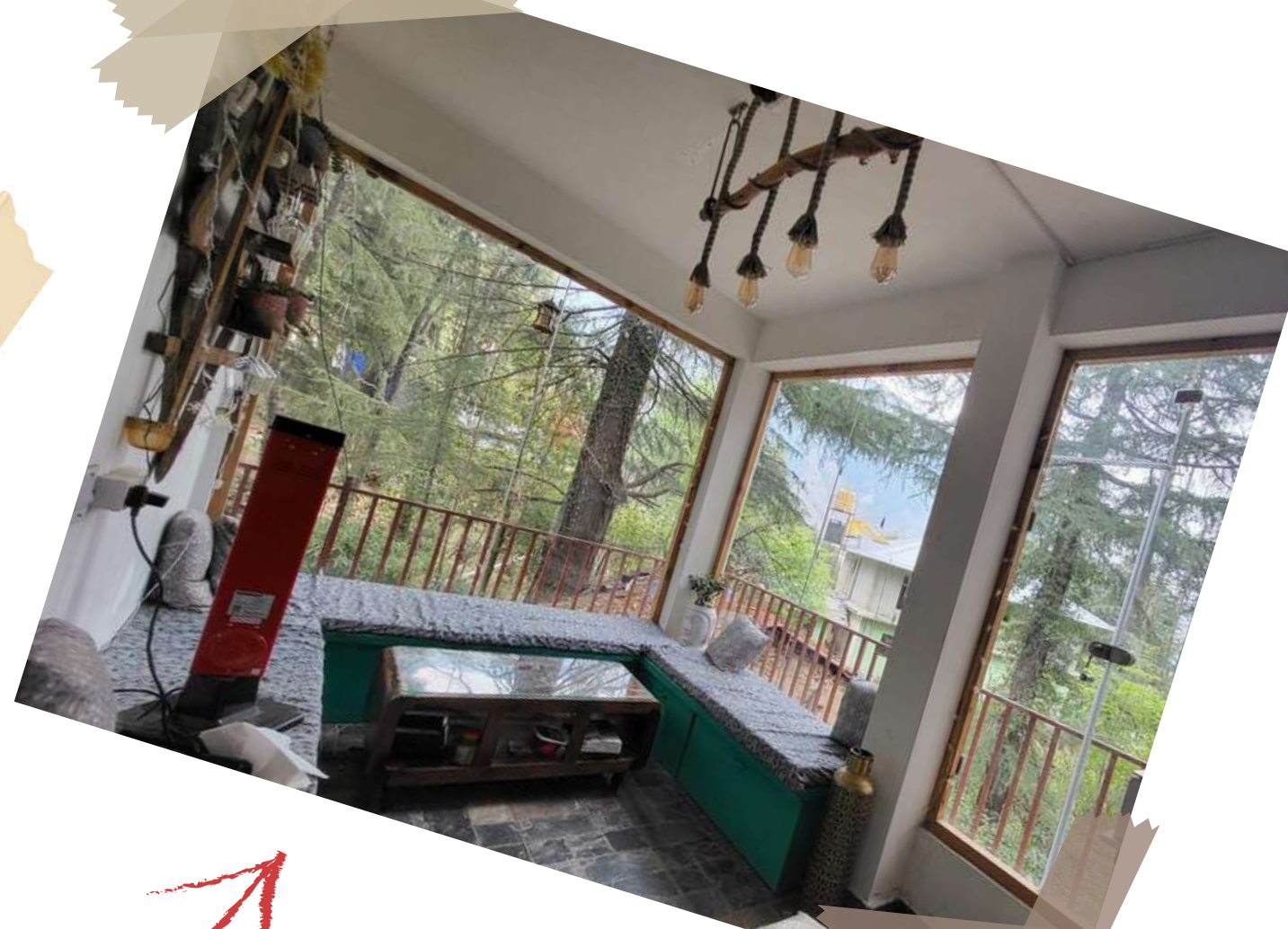
classroom, theater, therapy & workshop area