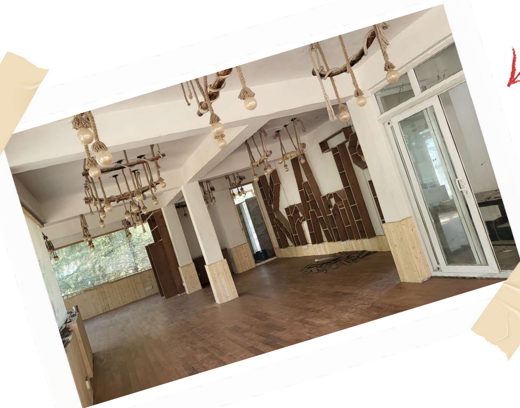
staff workspace & meeting area